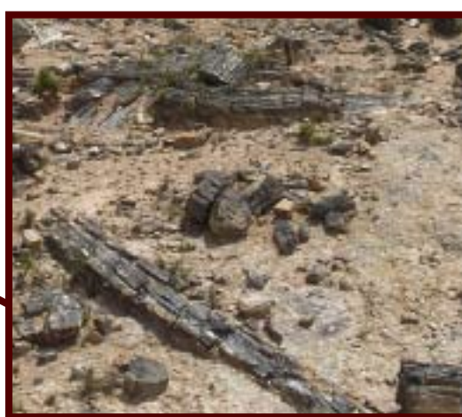
Petrified trees carried by lahars , or volcanic debris flows, were haphazardly deposited as logjams near Sexi.