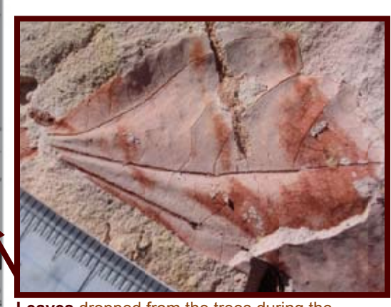
Leaves dropped from the trees during the eruption. Impressions of these leaves were preserved in volcanic ash.

Learn about the processes that fossilized the ancient forest in these rock layers.