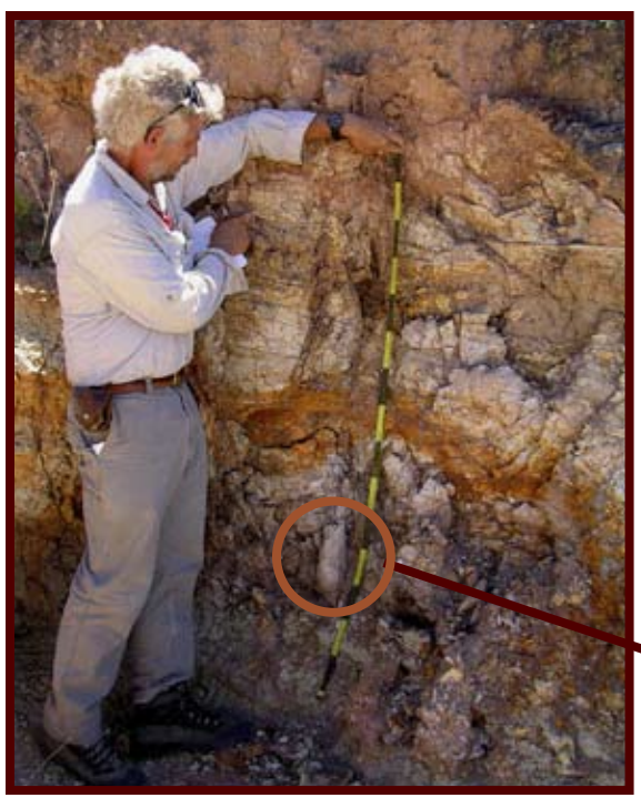
Paleosol (the ancient soil) was buried by volcanic ash. Trees rooted In the paleosol are Indicated by fossil stumps positioned "in situ," or in upright growth position, and extending up into the ash fall layer.